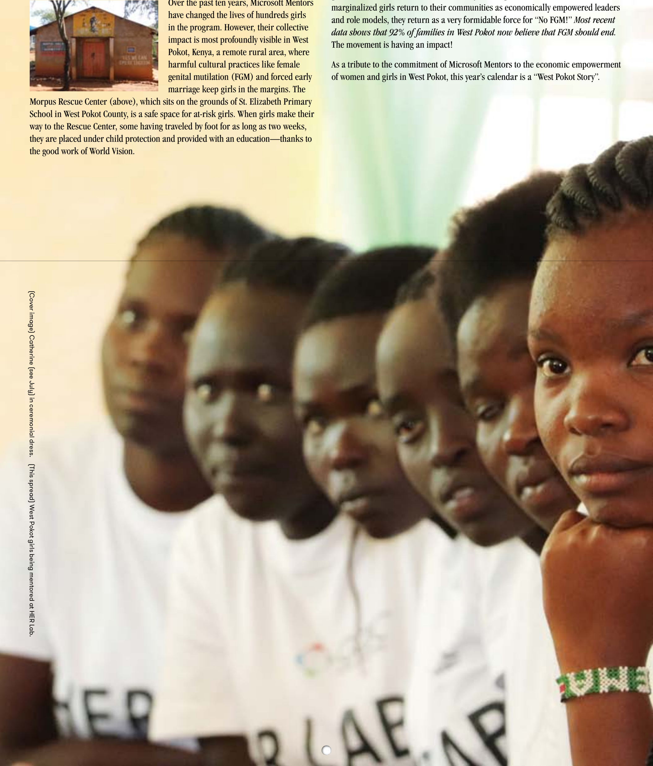
[Cover image] Catherine [see July] in ceremonial dress. [This spread] West Pokot girls being mentored at HER Lab.

As a tribute to the commitment of Microsoft Mentors to the economic empowerment of women and girls in West Pokot, this year’s calendar is a “West Pokot Story”.